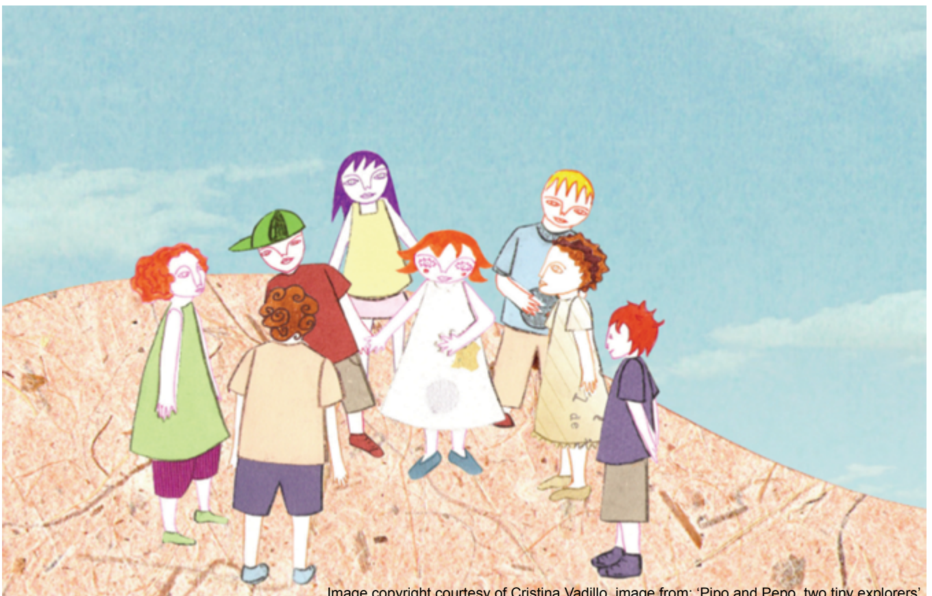
image from: 'Pipo and Pepo, two tiny explorers'.

Endocrine/endocrinology/endocrinologist: related to hormones; a doctor who specialises in hormones and how they affect changes in our bodies.